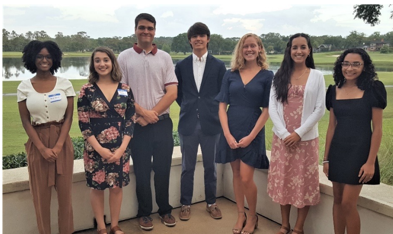
June 2021 Scholarship Award Winners